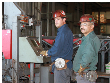
Martinez Steel employees overseeing work in their factory in Fontana.