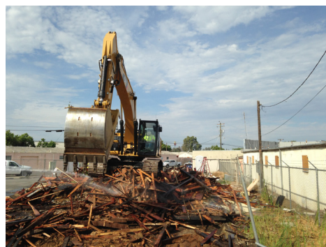
J. Kroeker, Inc. demolishing the Hollywood Inn in downtown Fresno on July 14.