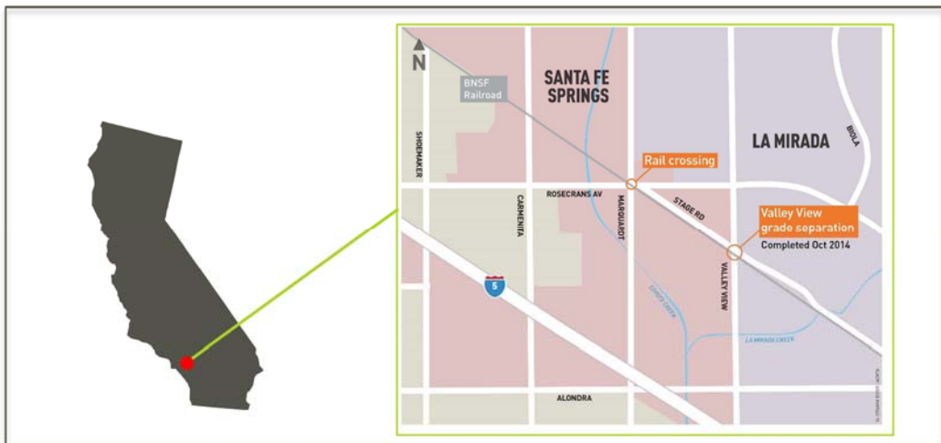
Figure 2: RM Project Location

The RM Grade Separation Project is located in Santa Fe Springs, CA between Los Angeles Union Station and the Anaheim Regional Transportation Intermodal Center (Figure 2). The RM Grade Separation Project site is currently an at grade rail crossing at the intersection of Rosecrans Ave and Marquardt Ave. The railway corridor through the Rosecrans/Marquardt intersection is owned by BNSF and it serves approximately 60 freight trains and 52 passenger trains per day in addition to roughly 45,000 – 52,000 vehicles per day 2 .