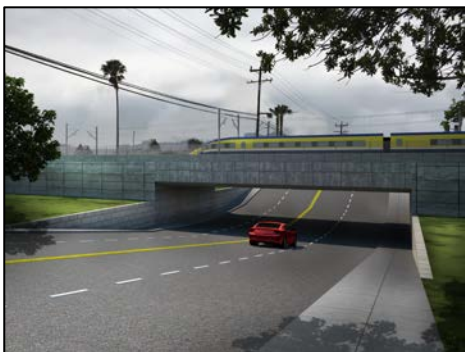
* HSR Grade Separation – Overcrossing Conceptual Illustration Only

A grade separation is a roadway that is re-aligned over or under a railway to enhance safety and mobility.