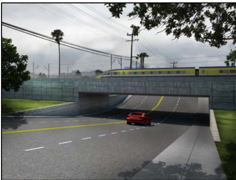
* Sonora Grade Separation – Overcrossing Conceptual Illustration Only

A grade separation is a roadway that is re-aligned over or under a railway to enhance safety and mobility.