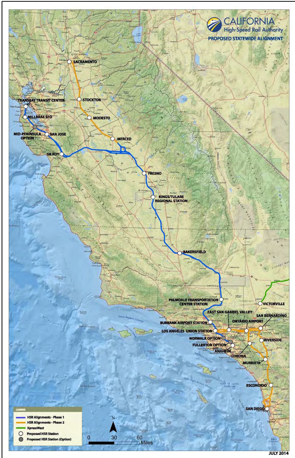
Exhibit 2 Proposed California HSR Statewide System