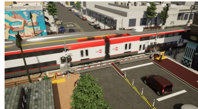
San Mateo At-Grade Crossing Artist Concept