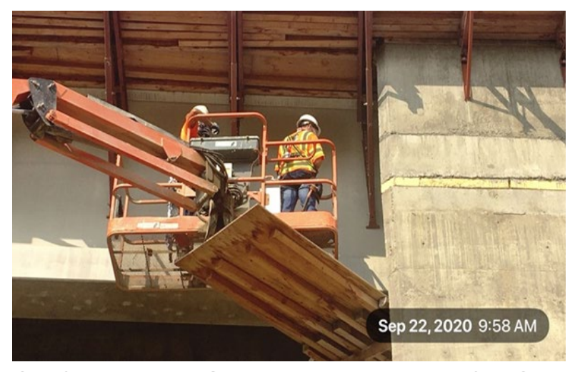
California High Speed Rail Authority & PCM performing ongoing bridge inspection for Road 27