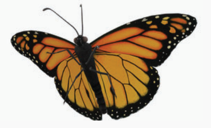
The monarch butterfly has been added as a candidate for protections under the federal Endangered Species Act.

Accordingly, the Authority conducted analysis of potential impacts to the monarch butterfly, and included revised and new mitigation measures.