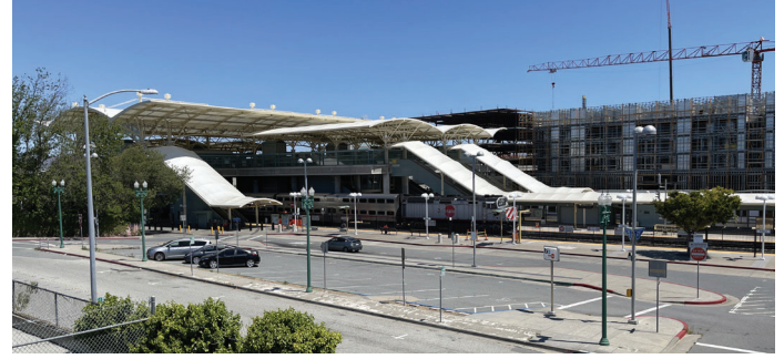
The Millbrae-SFO Station will provide connections from high-speed rail to BART, Caltrain, SamTrans, and other transit providers.

<sup>1</sup>National Environmental Policy Act: A Federal law that requires Federal agencies to assess the environmental effects of their proposed actions prior to making decisions. The environmental review, consultation, and other actions required by applicable federal environmental laws for this project are being or have been carried out by the State of California pursuant to 23 U.S.C 327 and a Memorandum of Understanding dated July 23, 2019 and executed by the Federal Railroad Administration and the State of California.