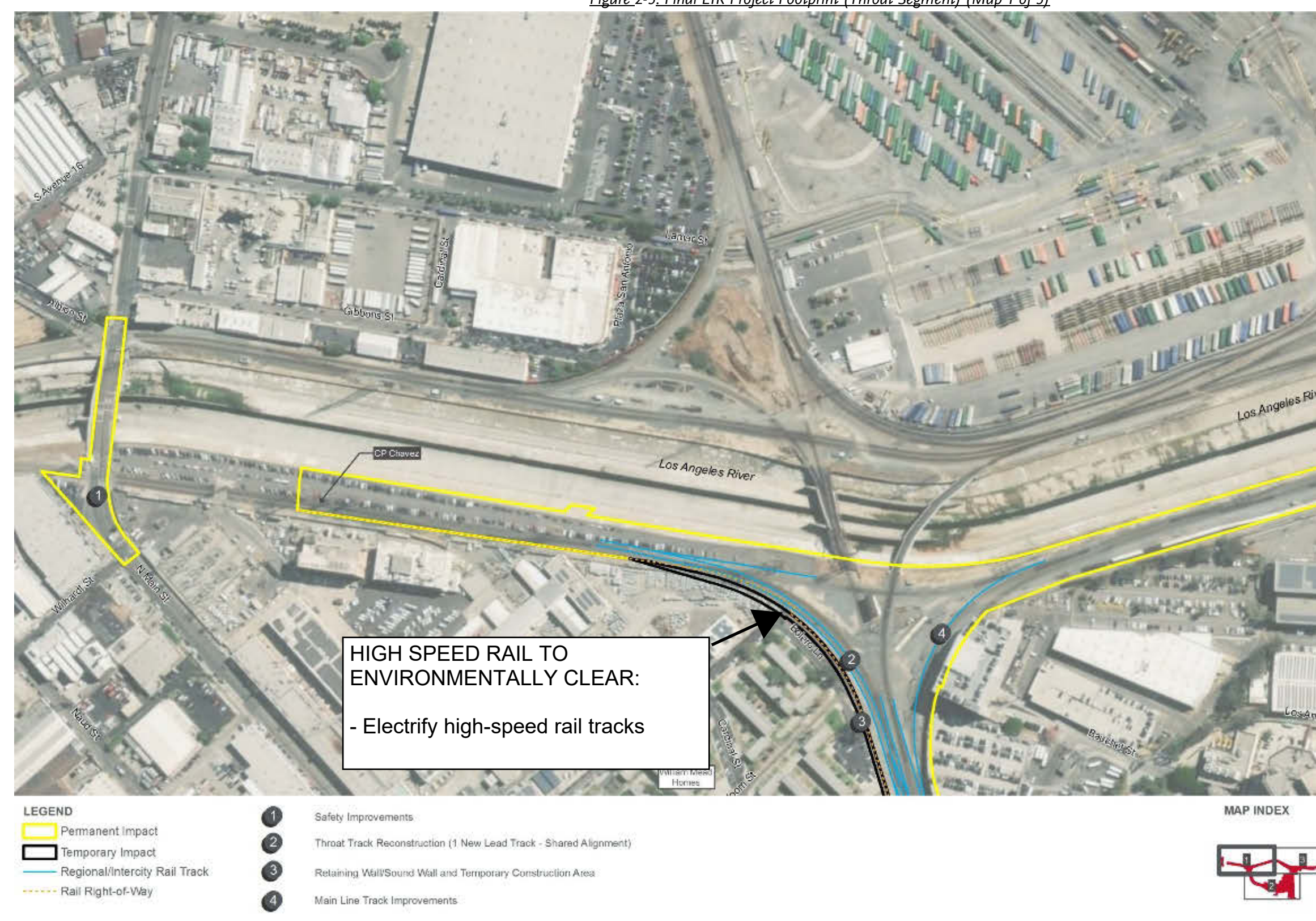
Figure 2-5. Final EIR Project Footprint (Throat Segment) (Map 1 of 5)