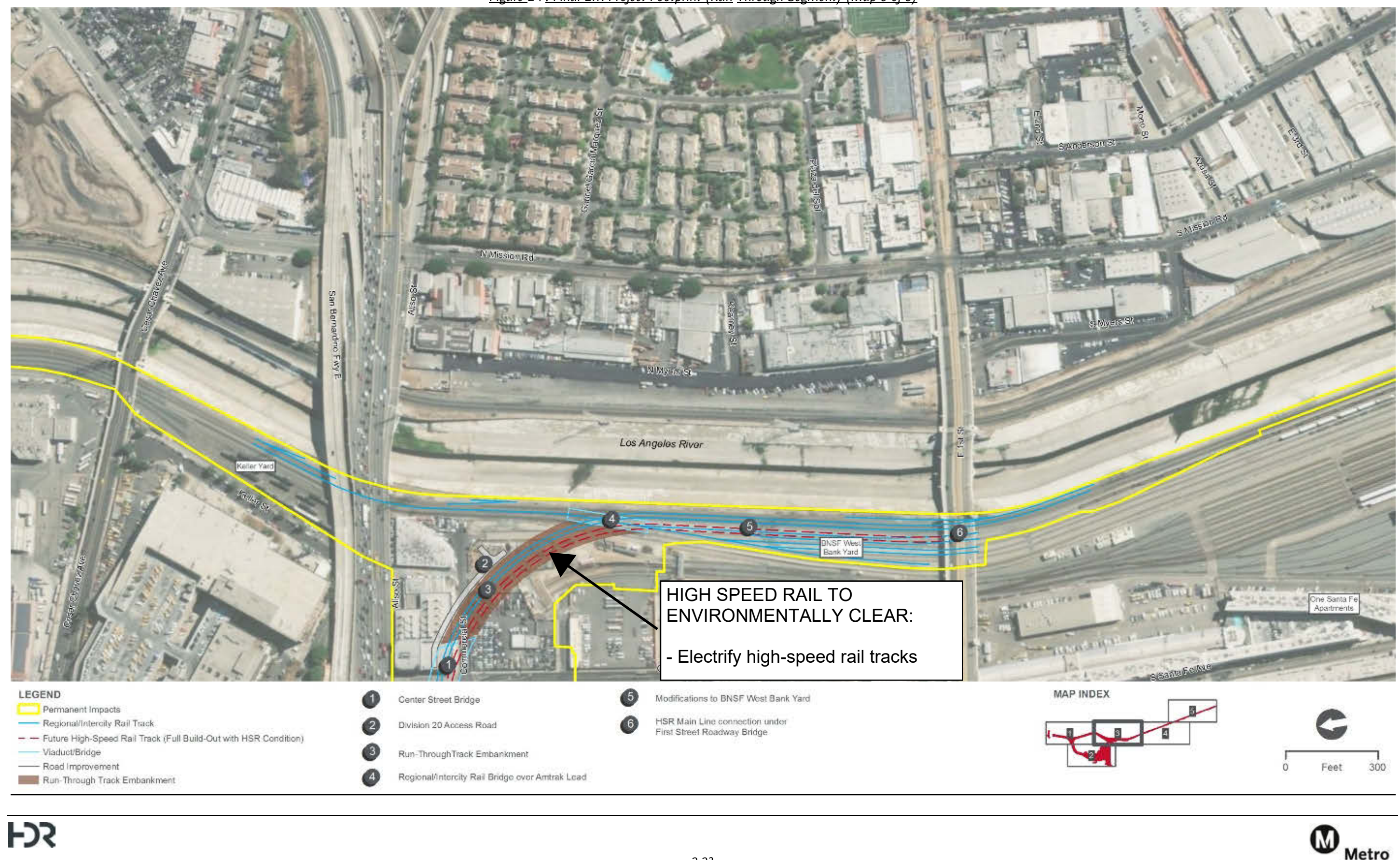
Figure 2-7. Final EIR Project Footprint (Run-Through Segment) (Map 3 of 5)