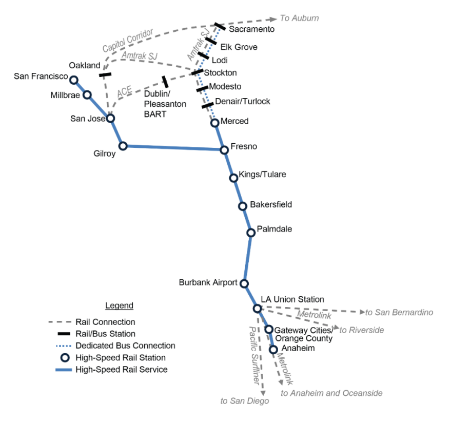
Figure 1.4 Phase 1-Open in 2029