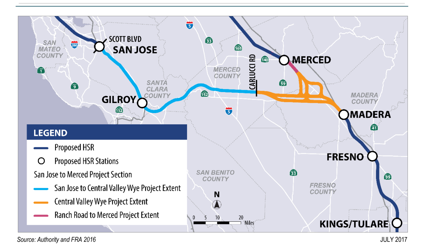
Figure 1 Proposed San Jose to Merced Project Section

Based on the 2010-2014 American Community Survey 5-year estimates for Santa Clara, San Benito, and Merced counties, San Benito County had the highest Hispanic/Latino population of the three counties. In Gilroy, more than half of the population was Hispanic/Latino. In 2014, Morgan Hill and San Martin were predominantly white while Gilroy and San Jose had the largest minority populations—approximately 68.5 and 72.5 percent minority, respectively. Morgan Hill was the least racially and ethnically diverse city, with only 50.7 percent minority representation. Table 1 shows the ethnic composition of the three-county region in 2014.