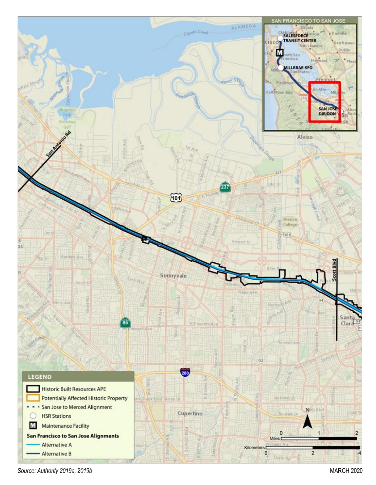
Figure 3.16-4 Potentially Affected Historic Property Locations—Mountain View to Santa Clara Subsection