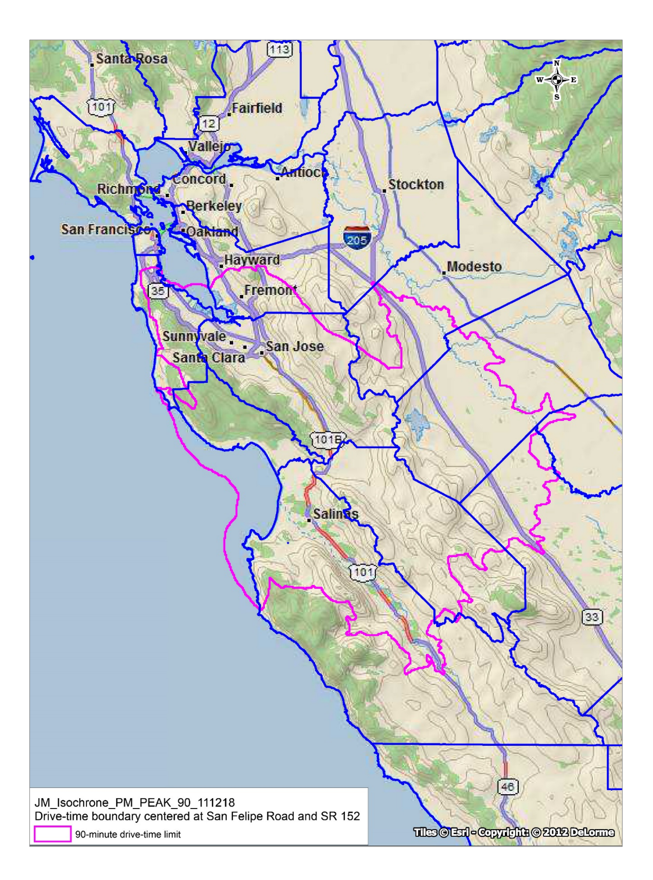
Figure 2 Isochrone Commute Shed for the San Jose to Merced Project Section