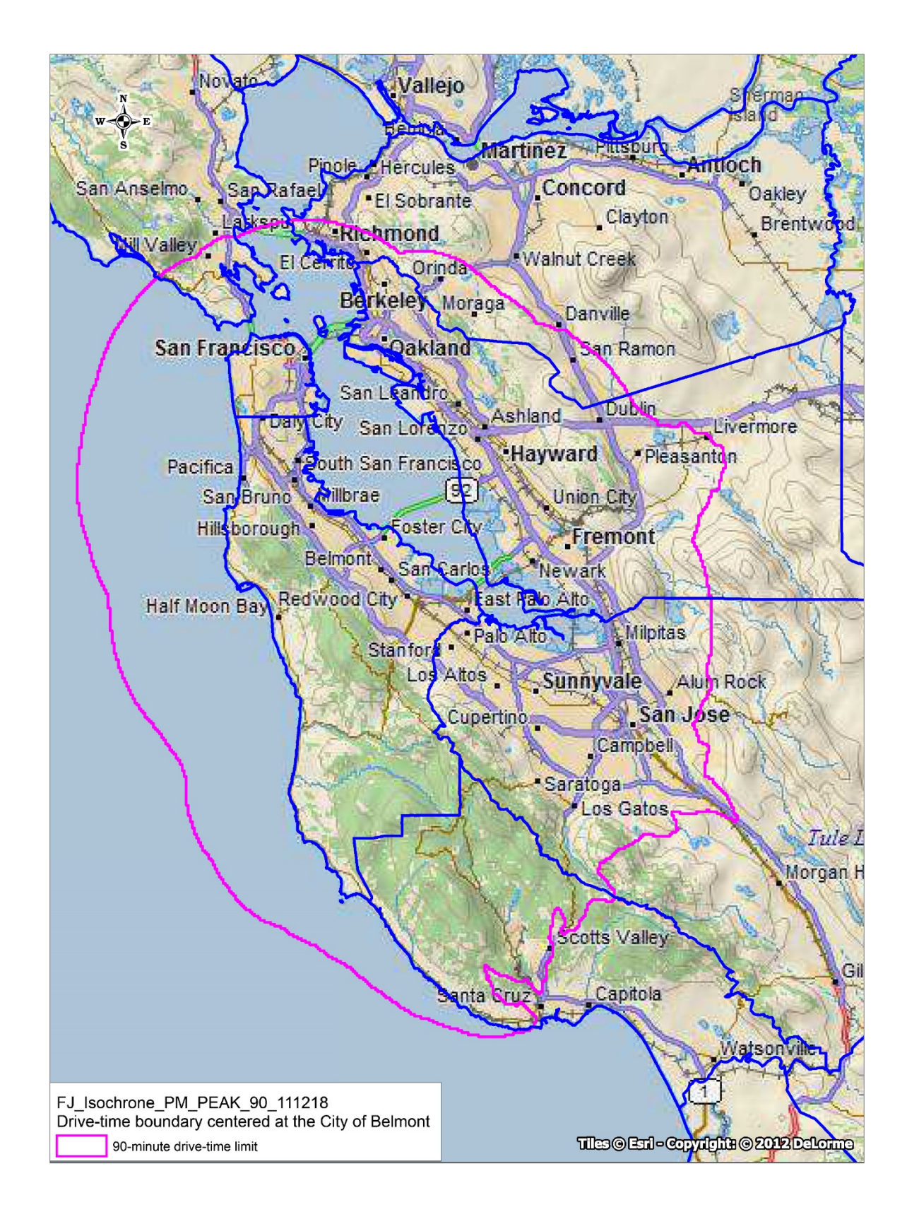
Figure 1 Isochrone Commute Shed for the San Francisco to San Jose Project Section