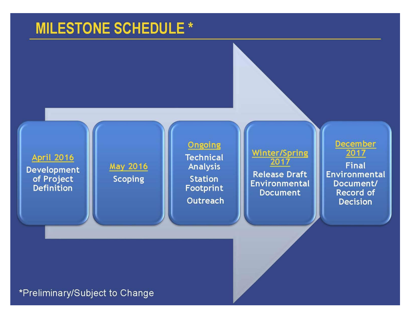
Figure 2 – Draft Milestone Schedule for San Francisco to San Jose Project Section

Source: High Speed Rail Authority Central Valley Technical Working Group presentation: 'Connecting and Transforming California,' Tuesday, March 29, 2016 - Gilroy, CA