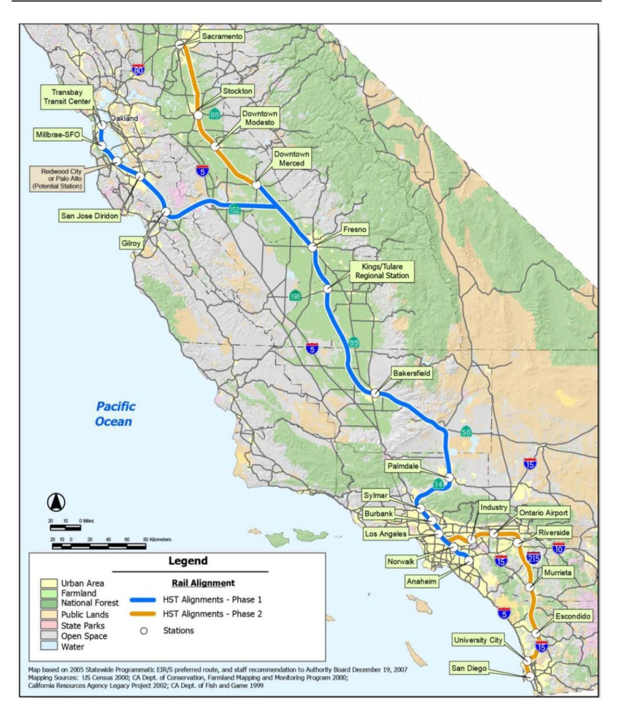
Figure S-1 California HST System initial study corridors