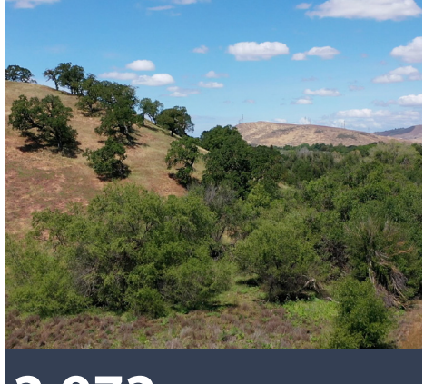
2,972 ACRES PRESERVED FOR NATURAL HABITAT AND RESTORATION