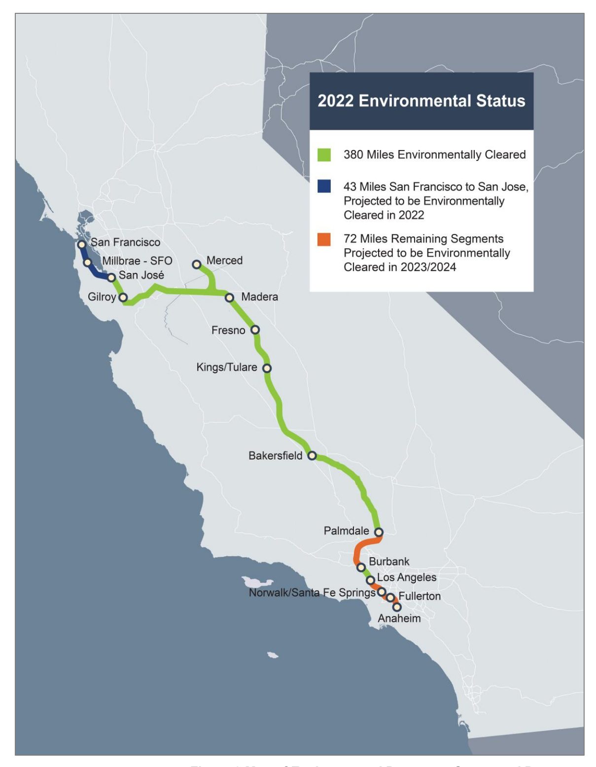
Figure 3 Map of Environmental Document Status and Progress