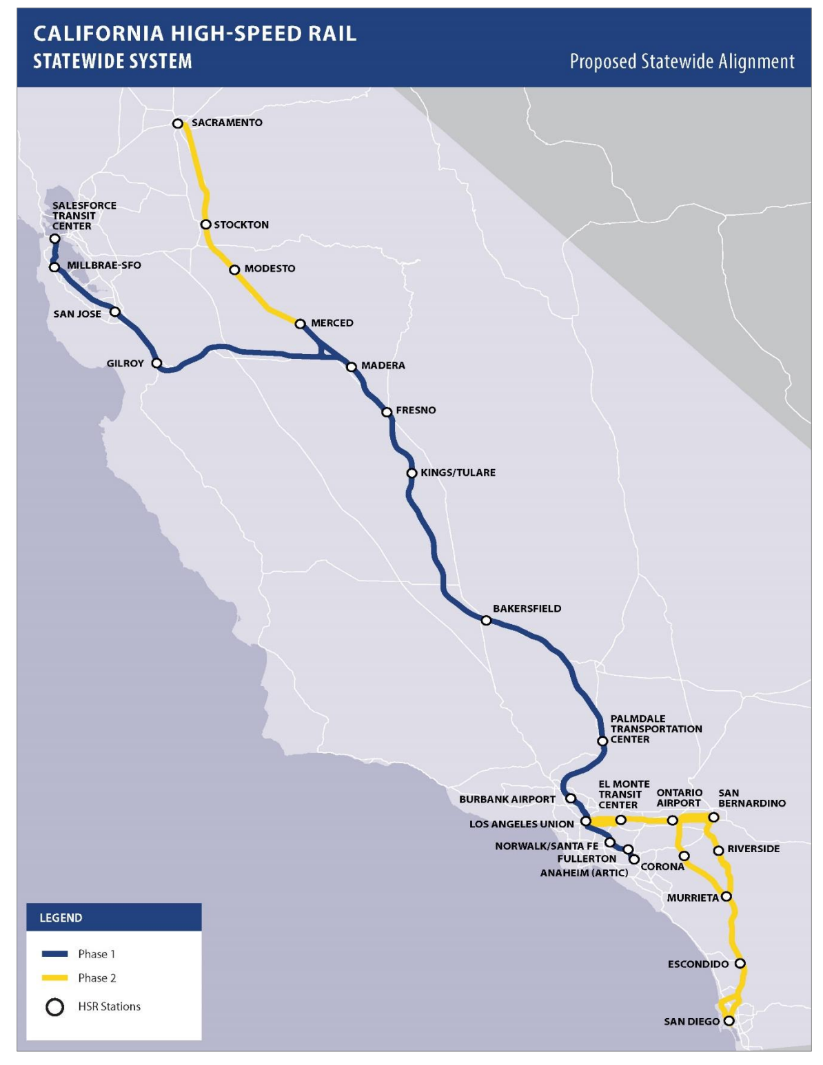
Figure 1 California High-Speed Rail Statewide System