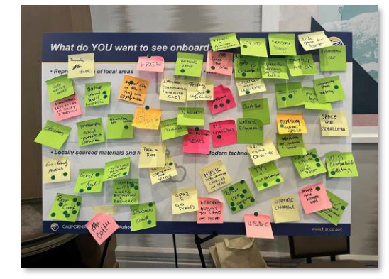
SCAG Regional Conference and General Assembly, May 2023