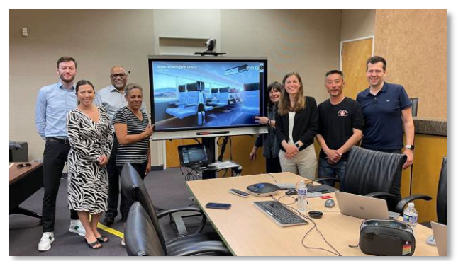
Central Valley stakeholder interviews, April 2023

Public events (e.g., conferences) and targeted outreach (e.g., to university students through the "I Will Ride" program) allow Californians throughout the state to engage with the project and provide their thoughts