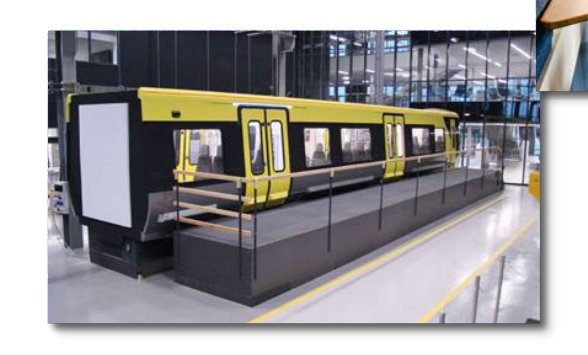
High-fidelity mockup example 2: Liverpool City Region Train, 2021

High-fidelity mockup example 1: New ICE design mockup, 2022