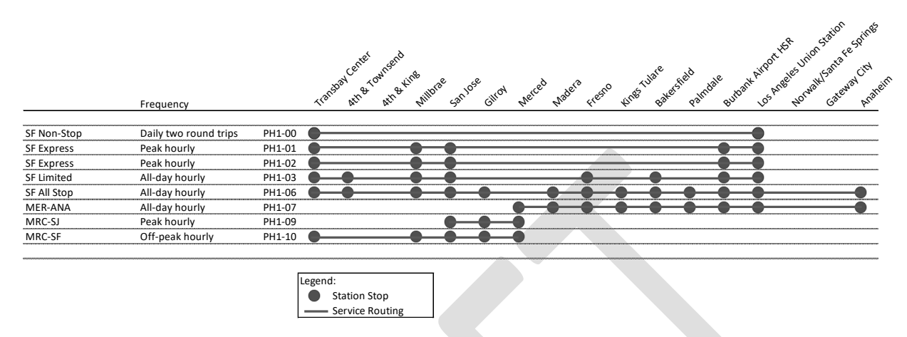
Figure 3-2 Service Structure Assumption for Phase 1

Limited-Stop train pattern service between Merced and San Jose/San Francisco (alternate Peak/Off-Peak services).