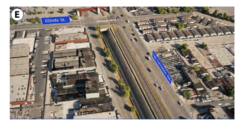
Proposed Olinda Street Configuration

At Olinda Street , the road will be open to through traffic and vehicles will travel across the existing Metrolink tracks above the high-speed rail train as it travels in a trench on its way to the underground Burbank Airport Station.