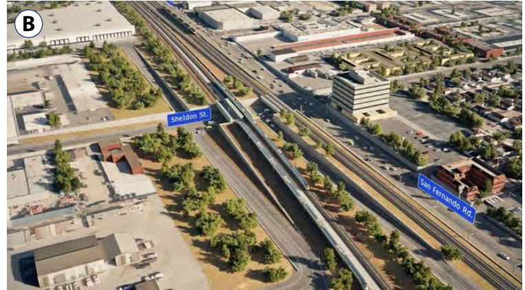
Proposed Sheldon St Configuration