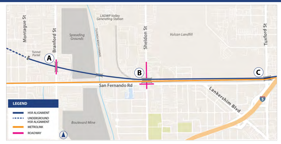
Grade Crossings from Montague St to Tuxford Street