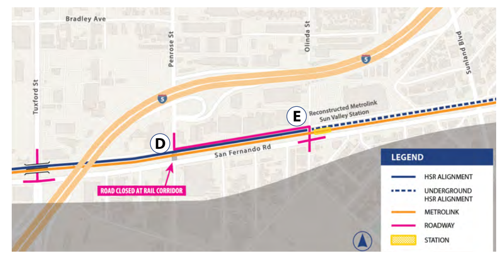
Grade Crossings from Tuxford Street to Olinda Street