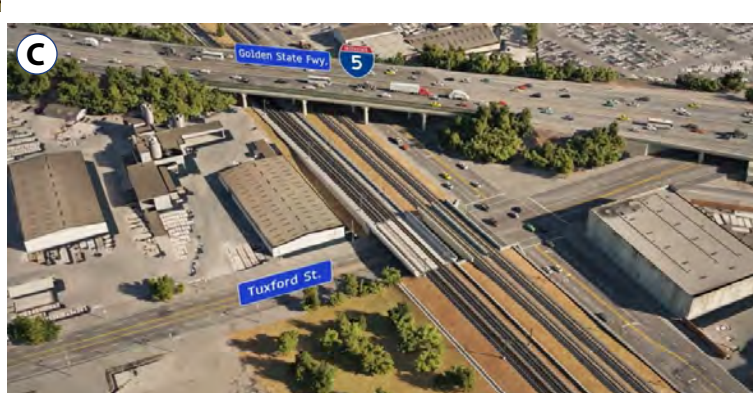
Proposed Tuxford Street Configuration