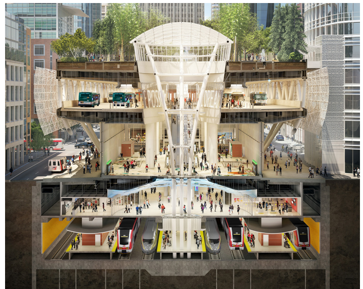
Rendering of future Salesforce Transit Center cross-section levels.

The Authority, along with partner agencies, Caltrain, Santa Clara Valley Transportation Authority (VTA), Metropolitan Transportation Commission (MTC), and the City of San José, are working together on the Diridon Station Integrated Service Plan (DISC). Diridon Station is poised to become one of the busiest intermodal hubs on the West Coast.