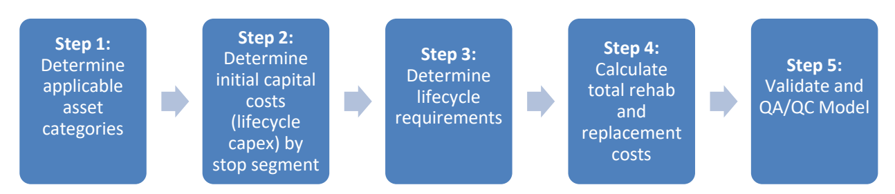
Figure 2 Development of Rehabilitation and Replacement Costs

The team took the following steps (Figure 2) to develop a 50-year forecast of rehabilitation and replacement costs.