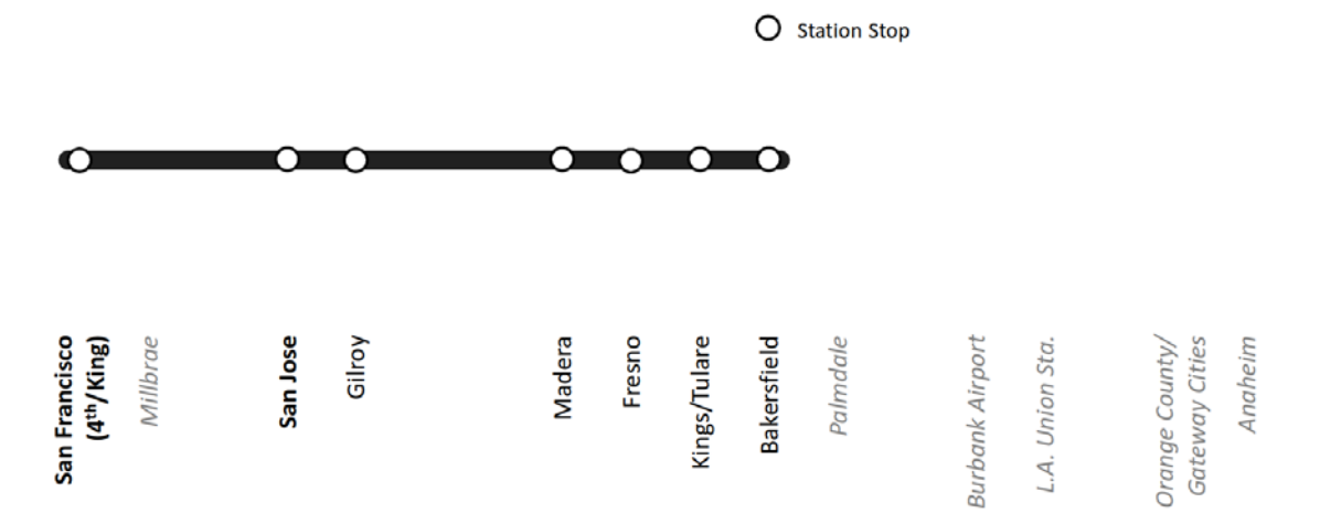
Figure 1 Service Structure Assumption for the California High-Speed Rail 2018 Business Plan: Silicon Valley to Central Valley Line

As an example, the Silicon Valley to Central Valley service patterns are shown in Figure 1. Figure 2 shows the assumed service structure for Phase 1, which consists of an all-stop local pattern and variations of limited-stop train patterns. These patterns are similar to the Phase 1 service structure assumed in the 2016 Business Plan but include improved service to Merced and stops at Madera for interchange with Amtrak San Joaquin services.