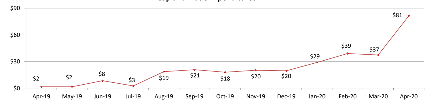
◆Cap and Trade Monthly Expenditures