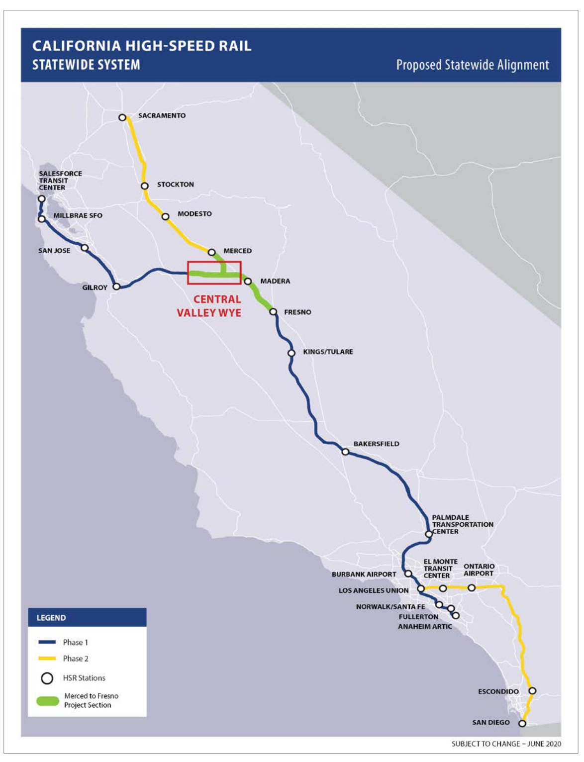
Figure 1 California HSR System