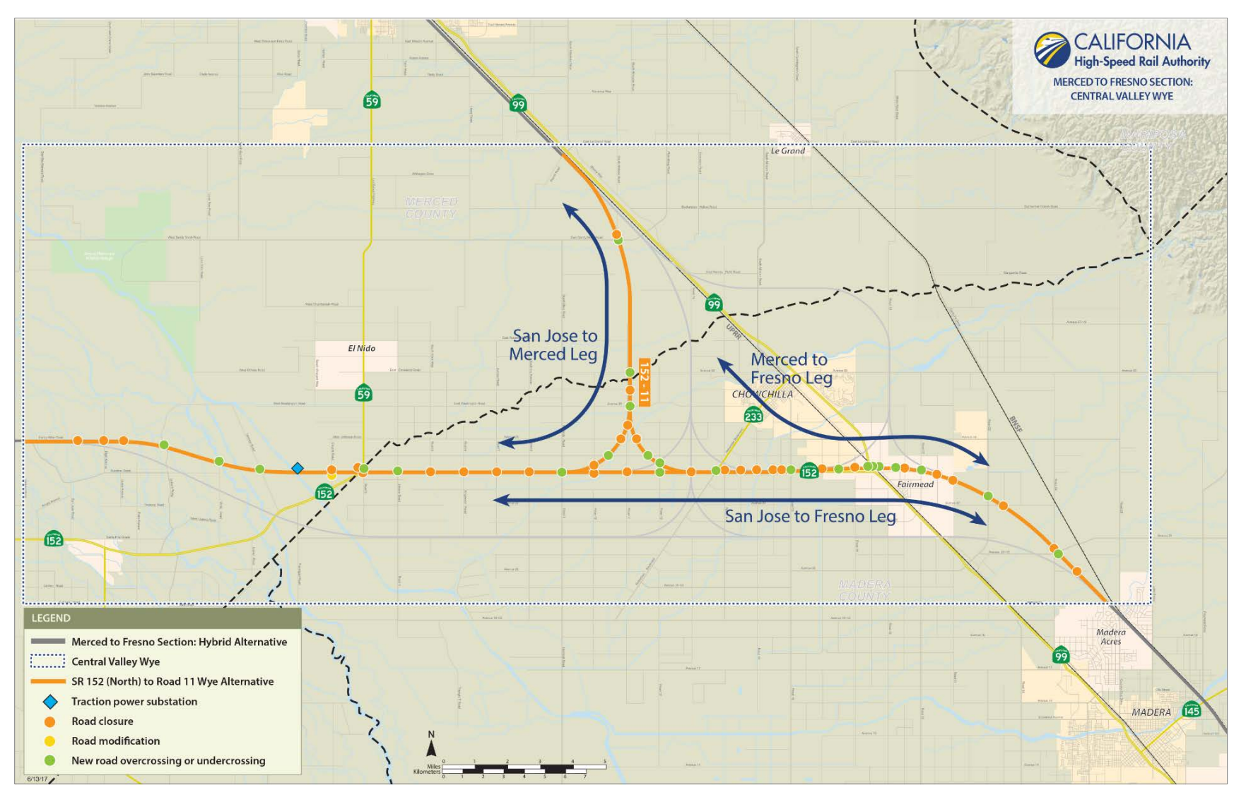
Figure 2 Preferred Alternative for the Central Valley Wye (SR 152 [North] to Road 11 Wye)