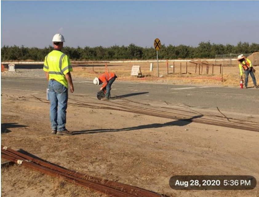
Removal of strands for tagging and inspection from WJE