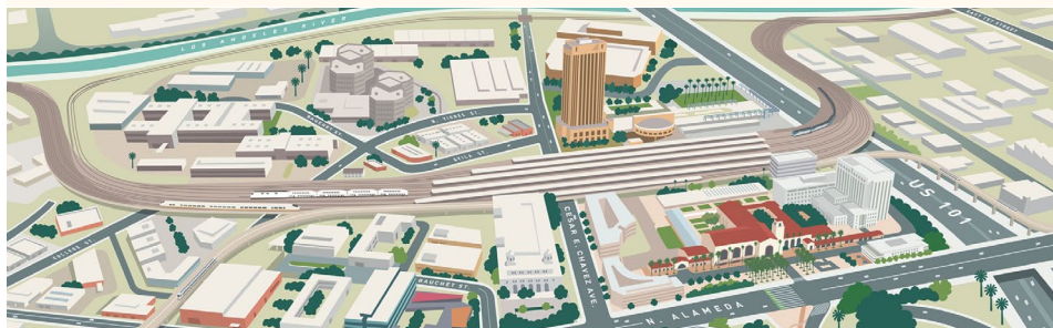
Rendering of proposed Link Union Station