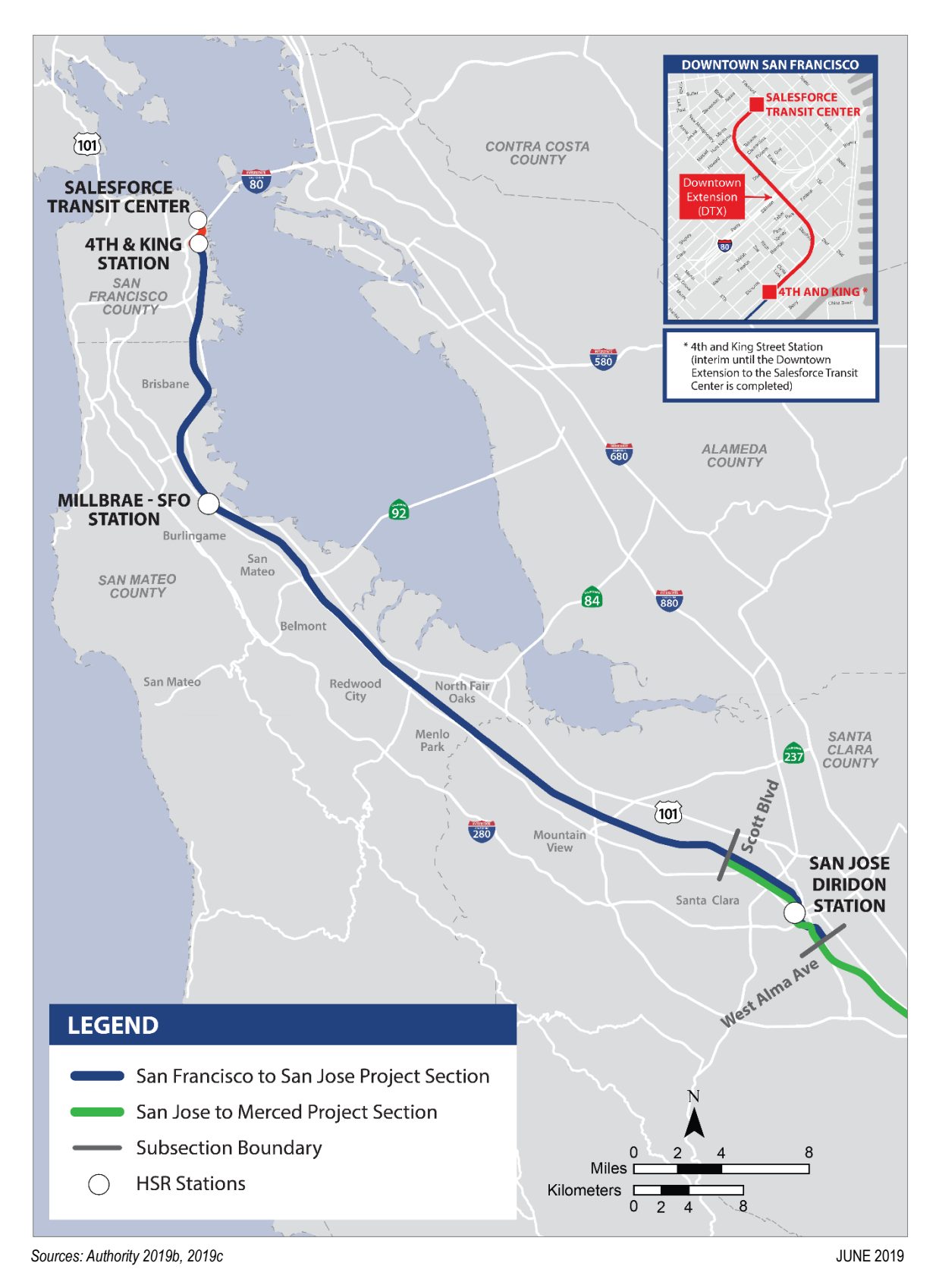
Figure 1-3 San Francisco to San Jose Project Section