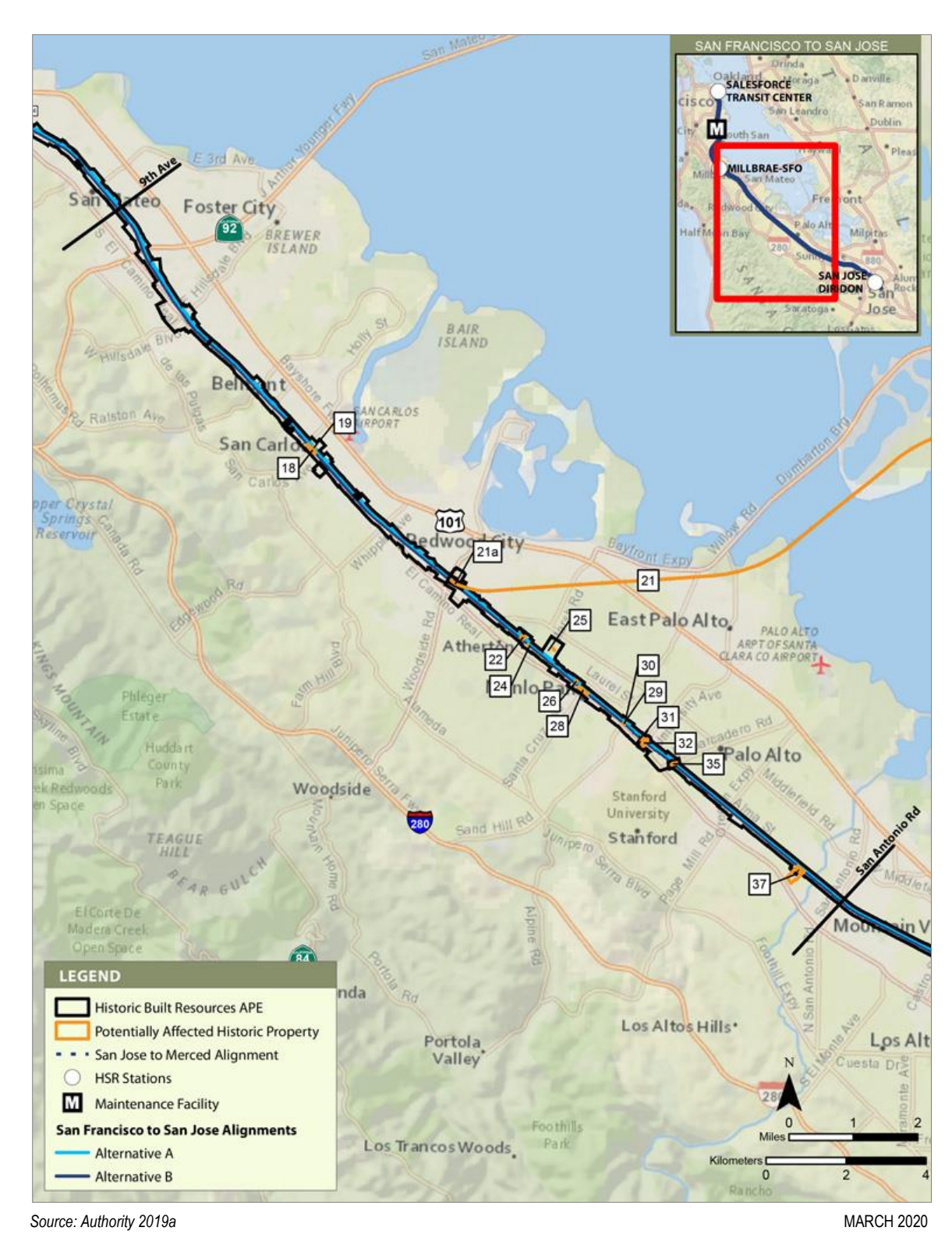
Figure 3.16-3 Potentially Affected Historic Property Locations—San Mateo to Palo Alto