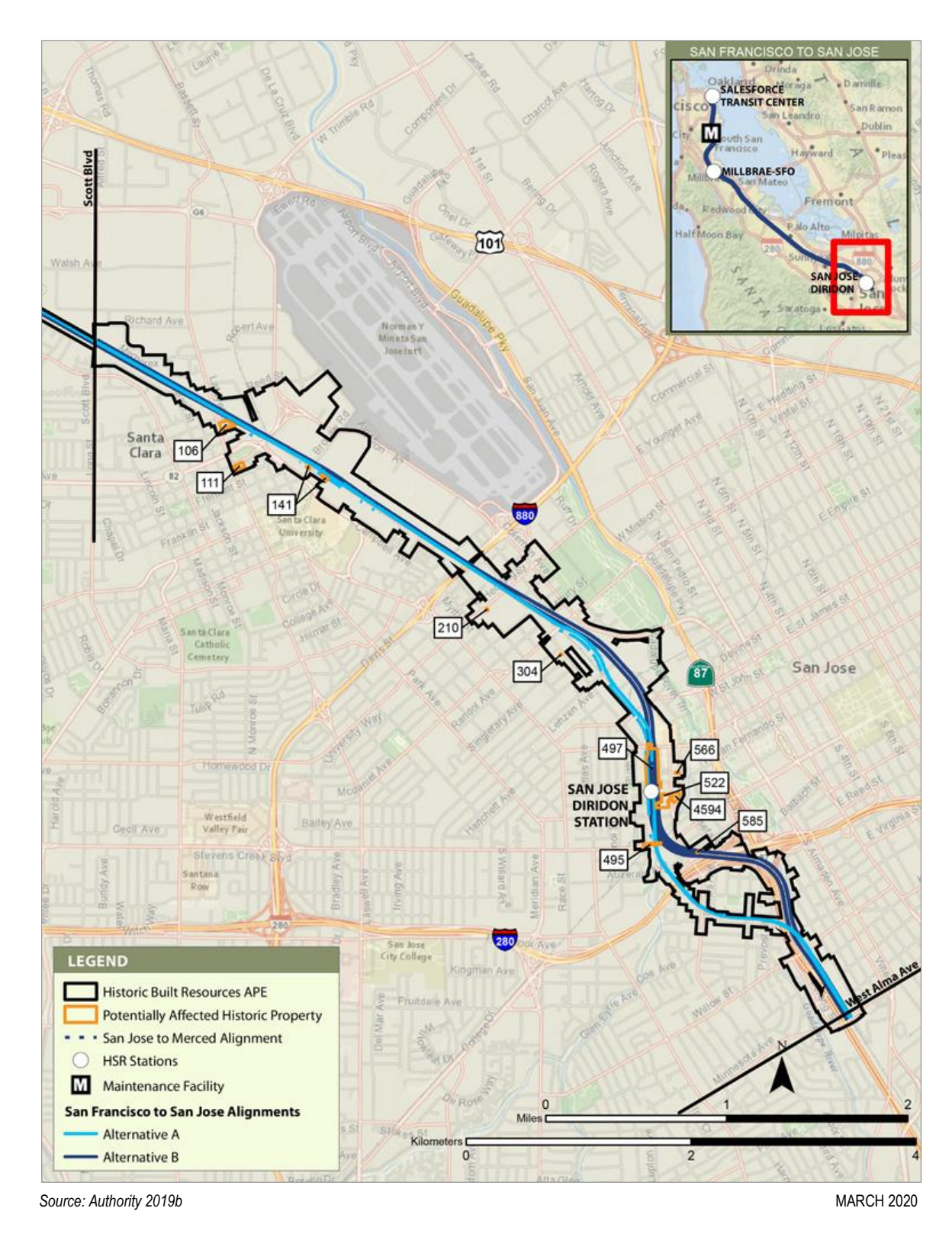
Figure 3.16-5 Potentially Affected Historic Property Locations—San Jose Diridon Station Approach Subsection