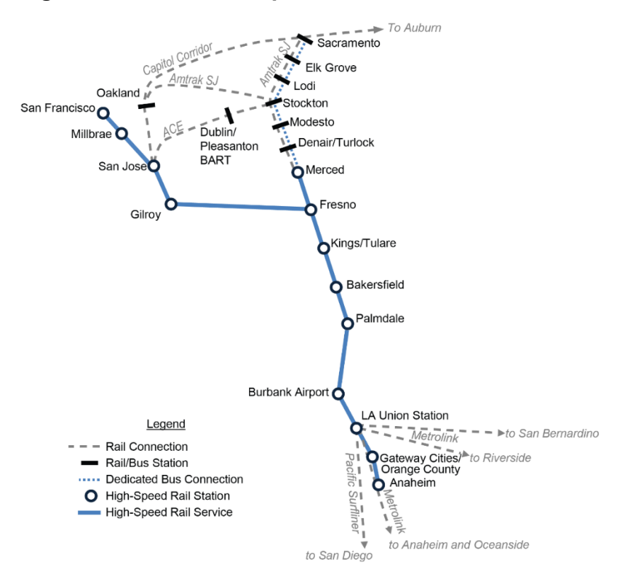
Figure 1.4 Phase 1-Open in 2029